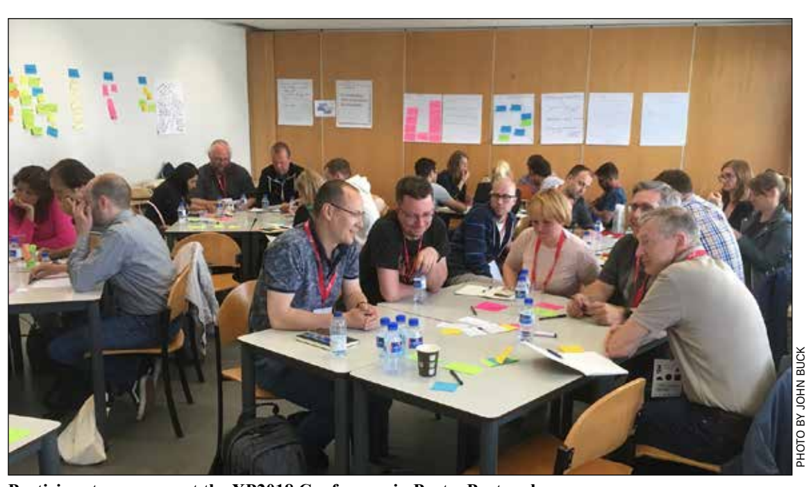
Participants\ converse\ at\ the\ XP2018\ Conference\ in\ Porto,\ Portugal.

Greenbelt is on the cutting edge of a world-wide movement to use Dynamic Community Governance to inspire the way we live and work together.